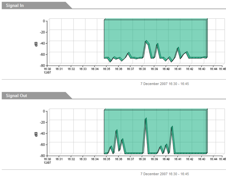
Figure 3. Signal In and Signal Out metrics are useful for tuning an echo canceller.

Cisco Systems' typical echo testing procedures expect you to gather these metrics by frequently running a command from the command-line interface during an active phone call. Now you can simply start up a VoIP Monitor Call Watch for a phone connected to the gateway under test, make a phone call to the PSTN to or from that phone, and take a look at the metrics as they are reported in real time. The signal levels are presented in a graph format that is continually updated during the tuning procedure.